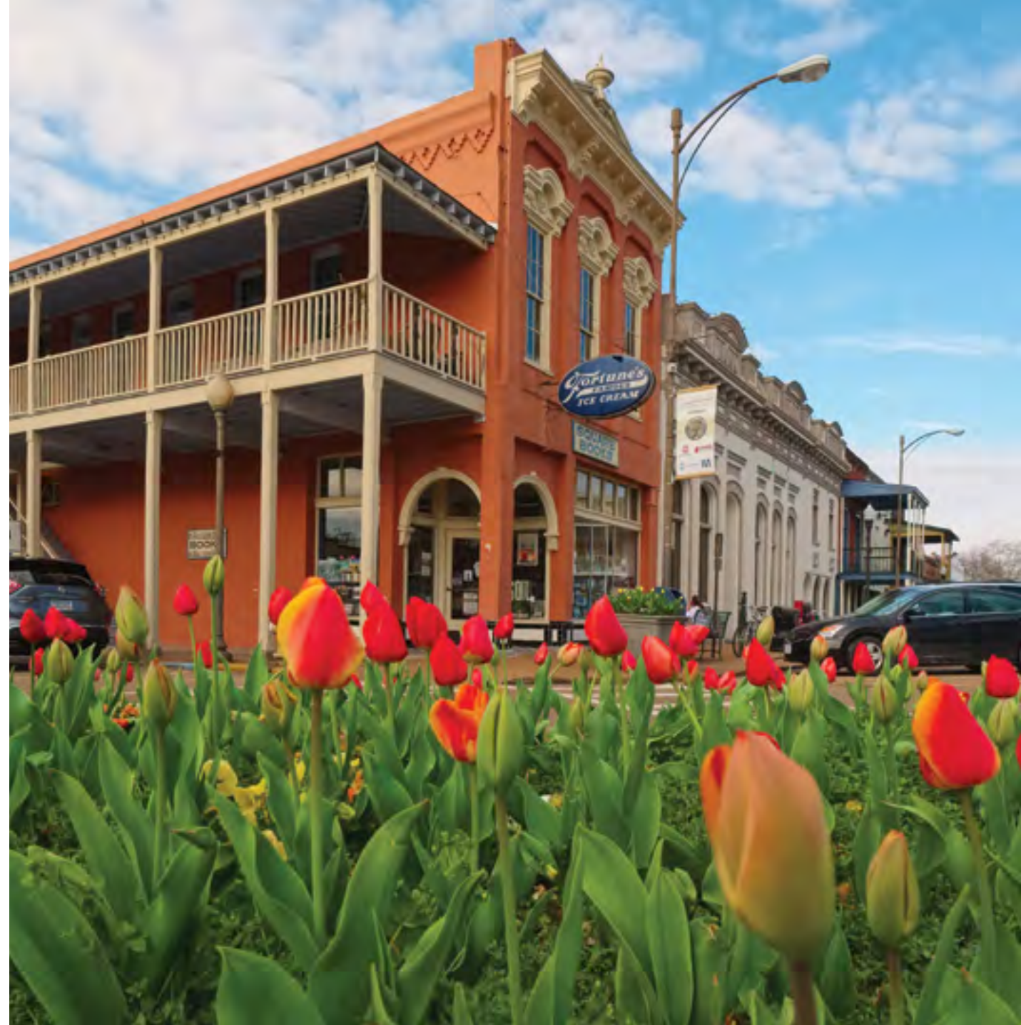
Arts / Culture / Food